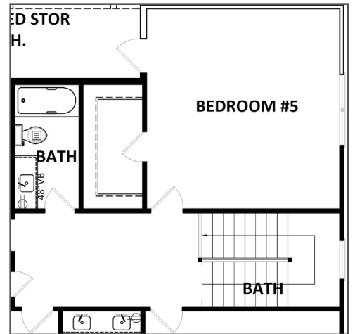
OPT. BEDROOM #5